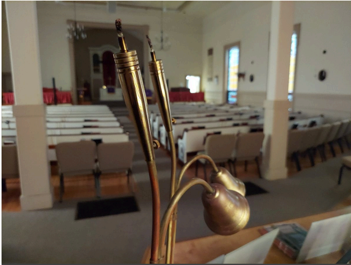
Candlelighters sit in the back of the empty sanctuary. Acolytes use these to light and extinguish the altar candles during worship services.

there is another training opportunity coming up this Sunday, the 26th. The training will happen immediately following the church service upstairs in the sanctuary and will last roughly 30 minutes. The goal is just to get our children more involved in the Sunday worship and for them to take some ownership over their church life. If you are a regular attending family with children 18 or under, we invite you to join us for this opportunity.